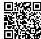
Scan for Installation Video